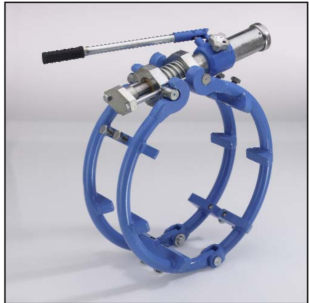
Hydraulic Cage Clamps DN 400/16"